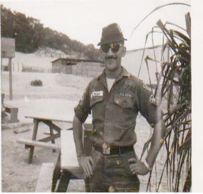
Vietnam Era Field Uniform