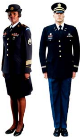
Currently Authorized Dress Blue Uniform

Veterans Day is Wednesday 11 November. Our Chapter will be an Active Participant in this year Sierra Vista Veterans Day Parade Starting at 0900 at 7 th and Wilcox.