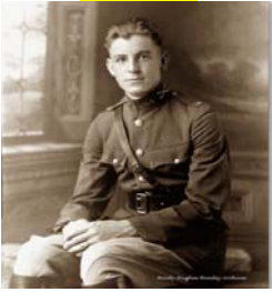
Cavalry Uniform Prior to WWII.