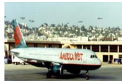
AIRCRAFT ON THE TARMAC AT SALT LAKE