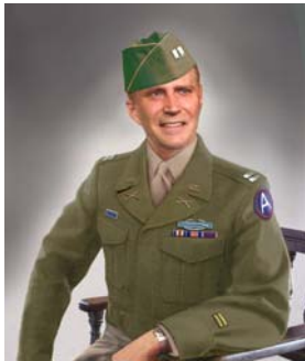
Captain in Ike Jacket – 3 D Army WWII