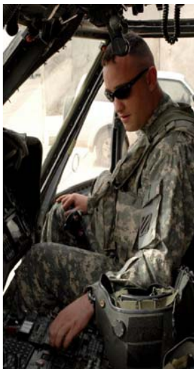
Warrant Officer Pilot in Current Combat Pattern Flight Suit